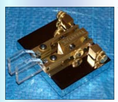
Vibroplex Code Warrior Light