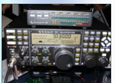
Elecraft W2 wattmeter