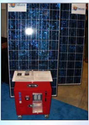
Helios solar power back-up