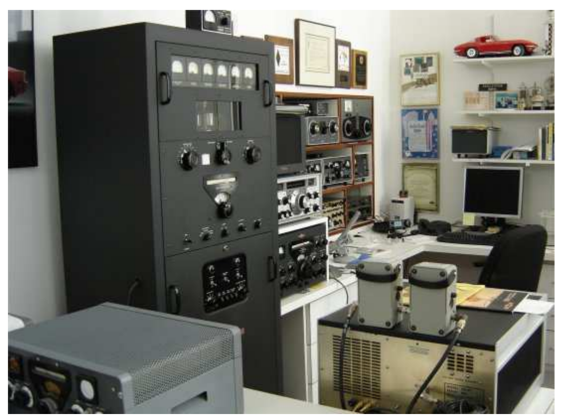
Like so many, I keep changing things. This photo is the most current (11/04) CE 100V in the foreground; KW-1/75A-4/HRO-500/312A-1 for AM; On the desk is a CX-11A used with an Alpha 77SX (rear view shown, with a pair of Bird wattmeters on top); Collins S-line and antenna tuners.