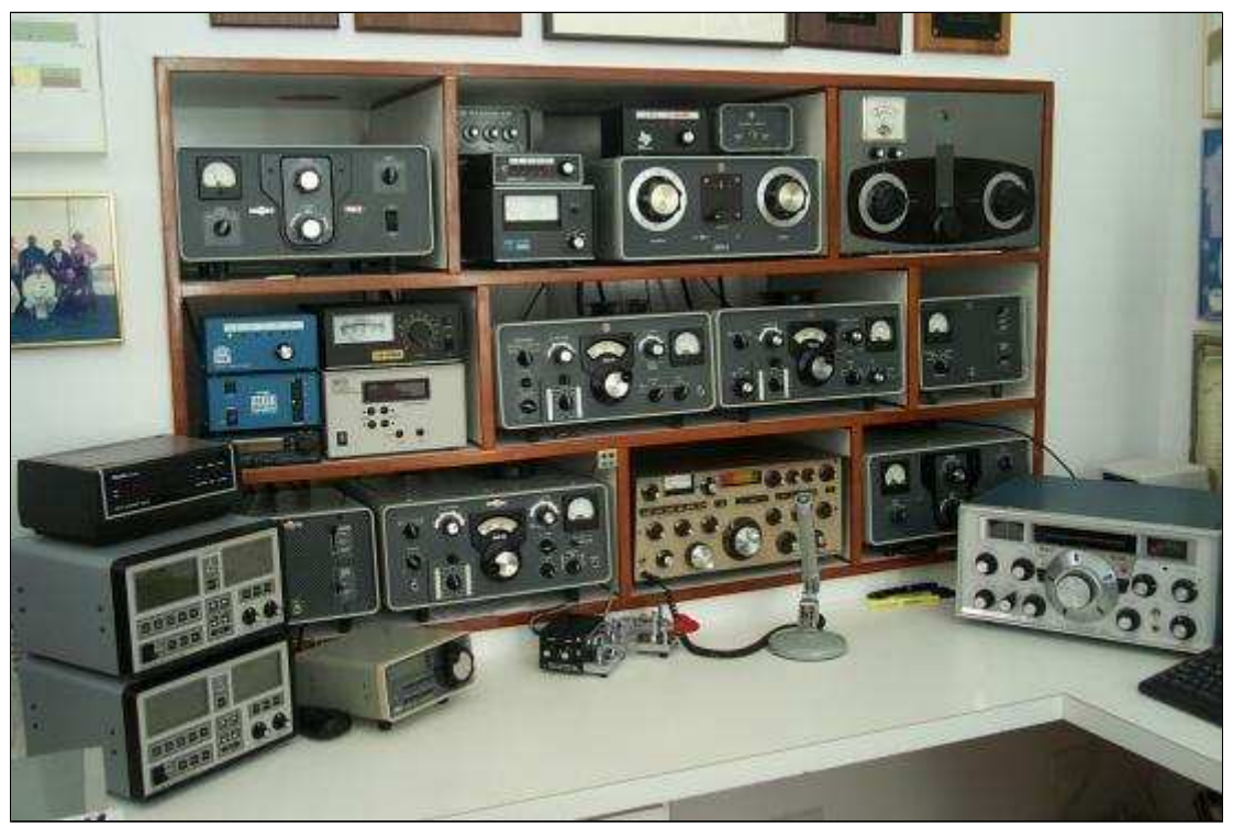
Desk: ARD 230 Amplifiers - DDS-2A - Keyers - SM-3 microphone - HRO-500 Bottom row: Rockwell 312B-4 and KWM-2A - Signal/One CX-11A - 30L-1