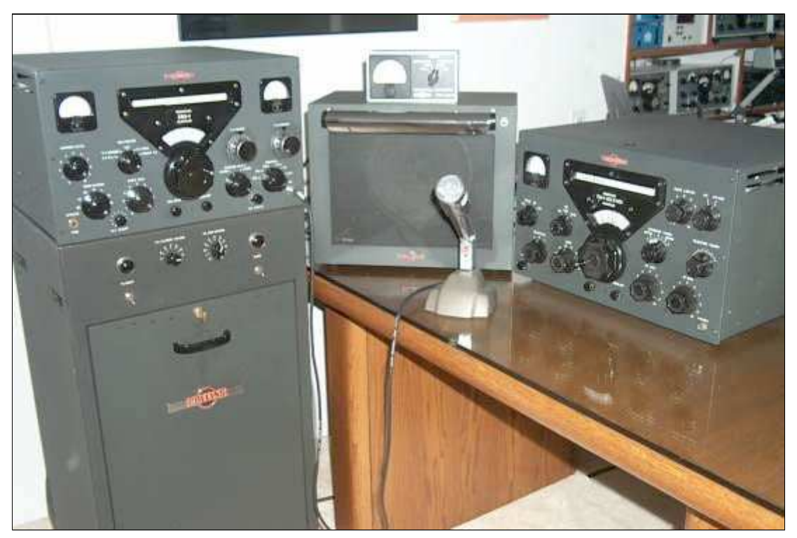
The Golddust corner! KWS-1 - 312A-1 (302C-1 on top) - EV664 - 75A-4