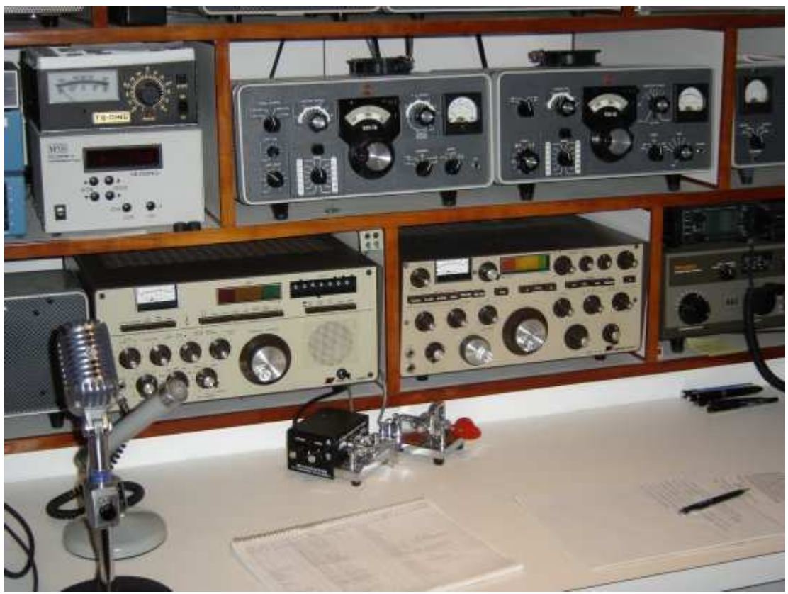
Current configuration: I now am the happy owner of Signal/Ones' two best efforts; the MilSpec 1030 (on the left) and the CX-11A (on the right). The Collins S3 line is on the second shelf. Not shown are the amplifiers; a 30S-1 for the S-line and a Alpha 77Sx/Dx for the Sig/Ones.