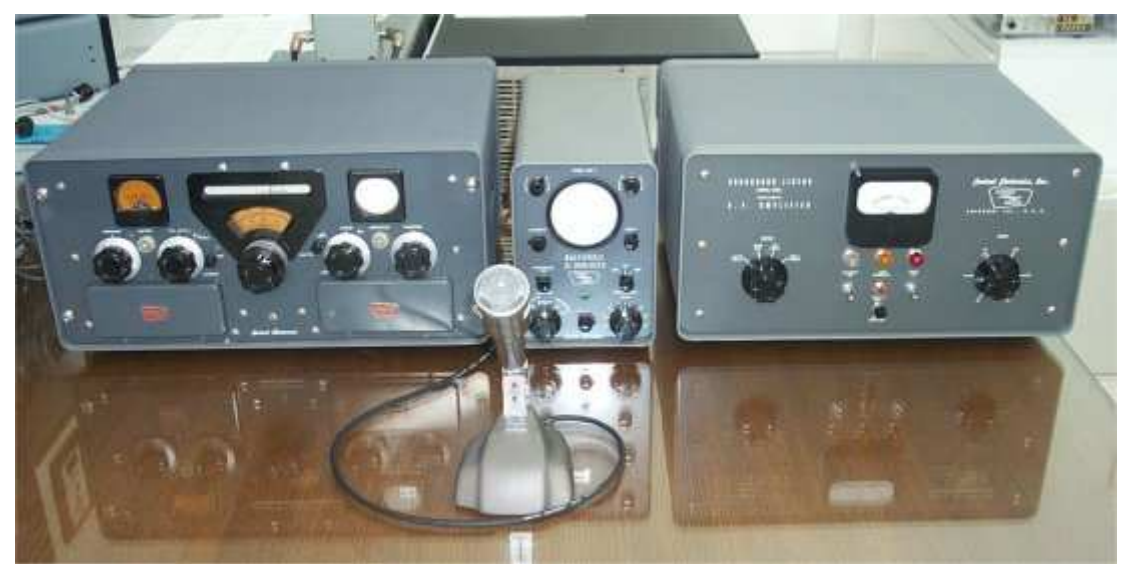
CE station - 100V/MM-2/600L amplifier