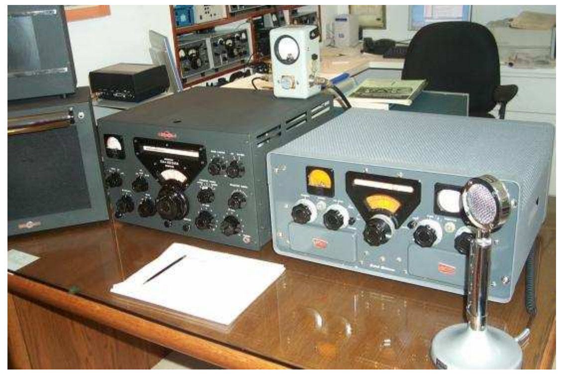
An example of a late '50's station - 75A-4 and CE 100V. Great fun!