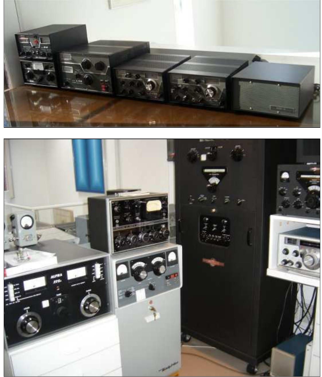
Drake Station - C-4/MN-2000/L-4B/T-4XC/R-4C/MN-4/AC-4