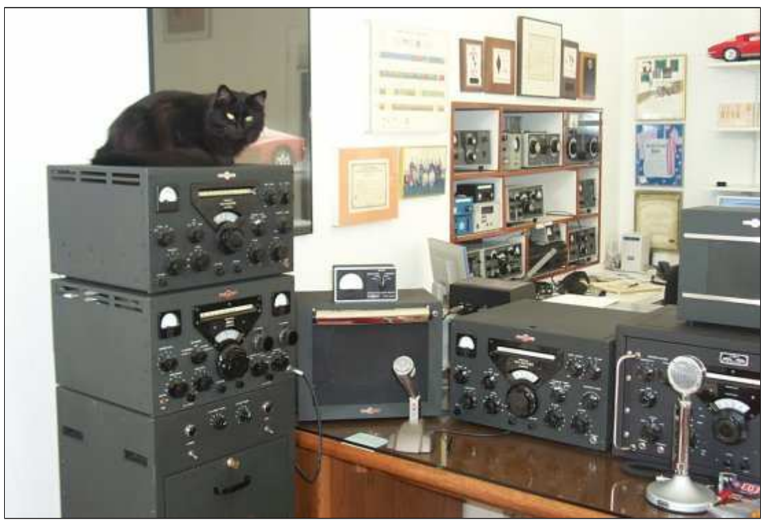
Another view of the Golddust corner with our "watch cat"